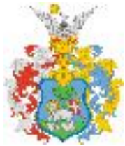
Debrecen, Hungary – 1990